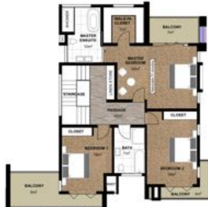
FIRST FLOOR PLAN AREA: 121m 2