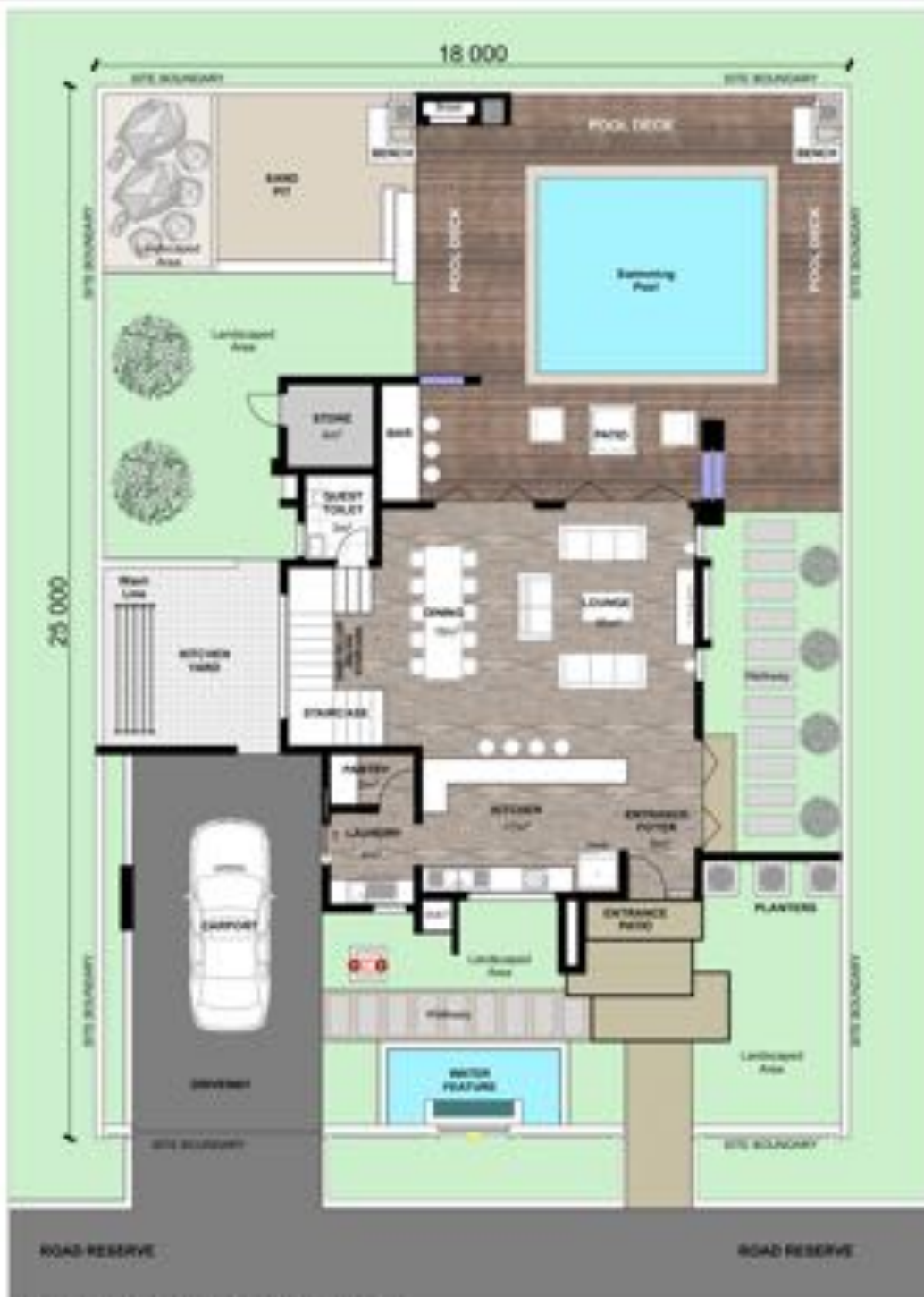
GROUND FLOOR PLAN AREA: 100m 2